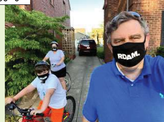
You might notice that we are wearing masks because it is now mandatory to wear masks in our county