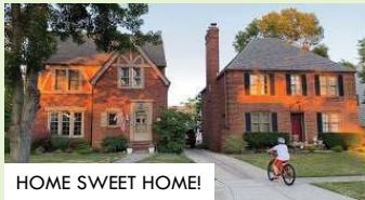
HOME SWEET HOME!