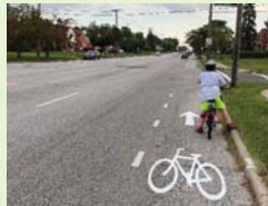
Exploring the new Warrensville Ctr. Road bike lane