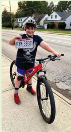
A roadkill license plate for Dad's collection!